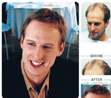
Individual results may vary.

"Before my Bosley ® hair restoration procedure, I thought about my hair constantly –